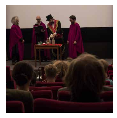
Jedinečné Svatopěstitelské Družstvo, Upsych 316a a Jednotky Špružení Šmelcu and a few perspectives on scrap films, photographs, small Poodja 2. October, 2017, 20:00, Ponrepo Cinema

On the occasion of a new archival item, we prepared a composed evening at Ponrepo Cinema which presents the activities of the Peerless Cooperative of Holy Nurture, Upsych316a, and the Holy Scrap unit.